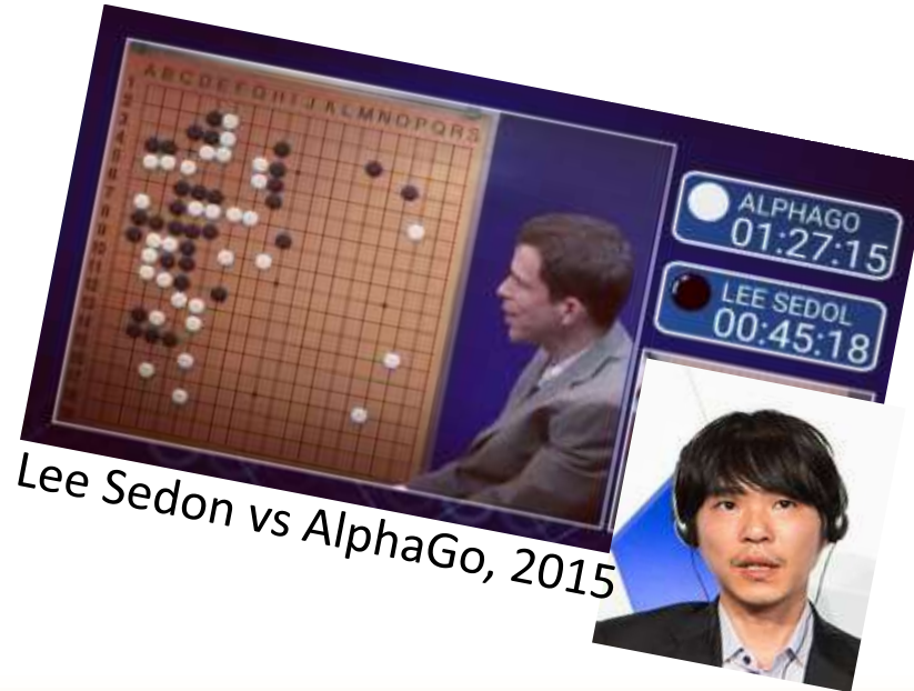
Lee Sedon vs AlphaGo, 2015