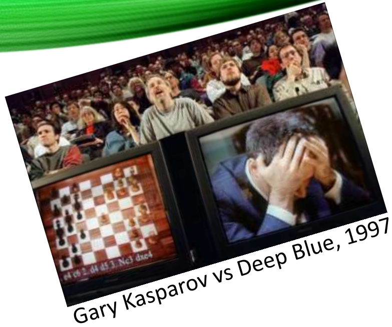
Gary Kasparov vs Deep Blue, 1997