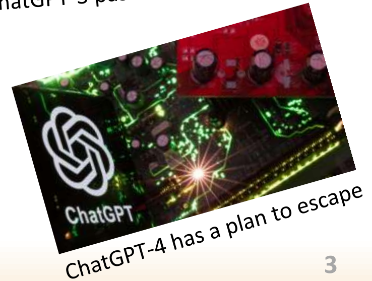
ChatGPT-4 has a plan to escape