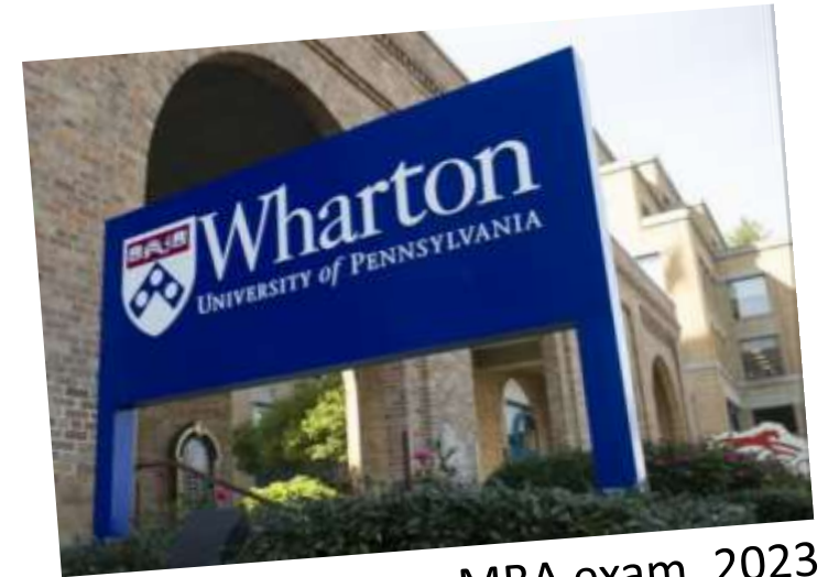
ChatGPT-3 passes MBA exam, 2023