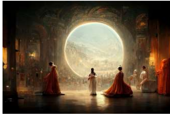
Midjourney wins an art prize, 2022