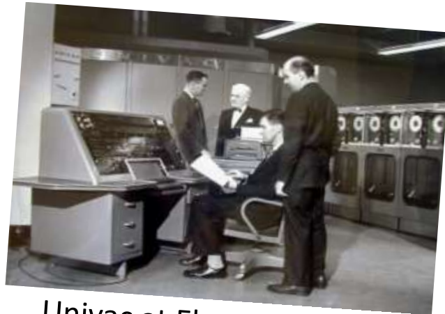
Univac at Elections (1952)